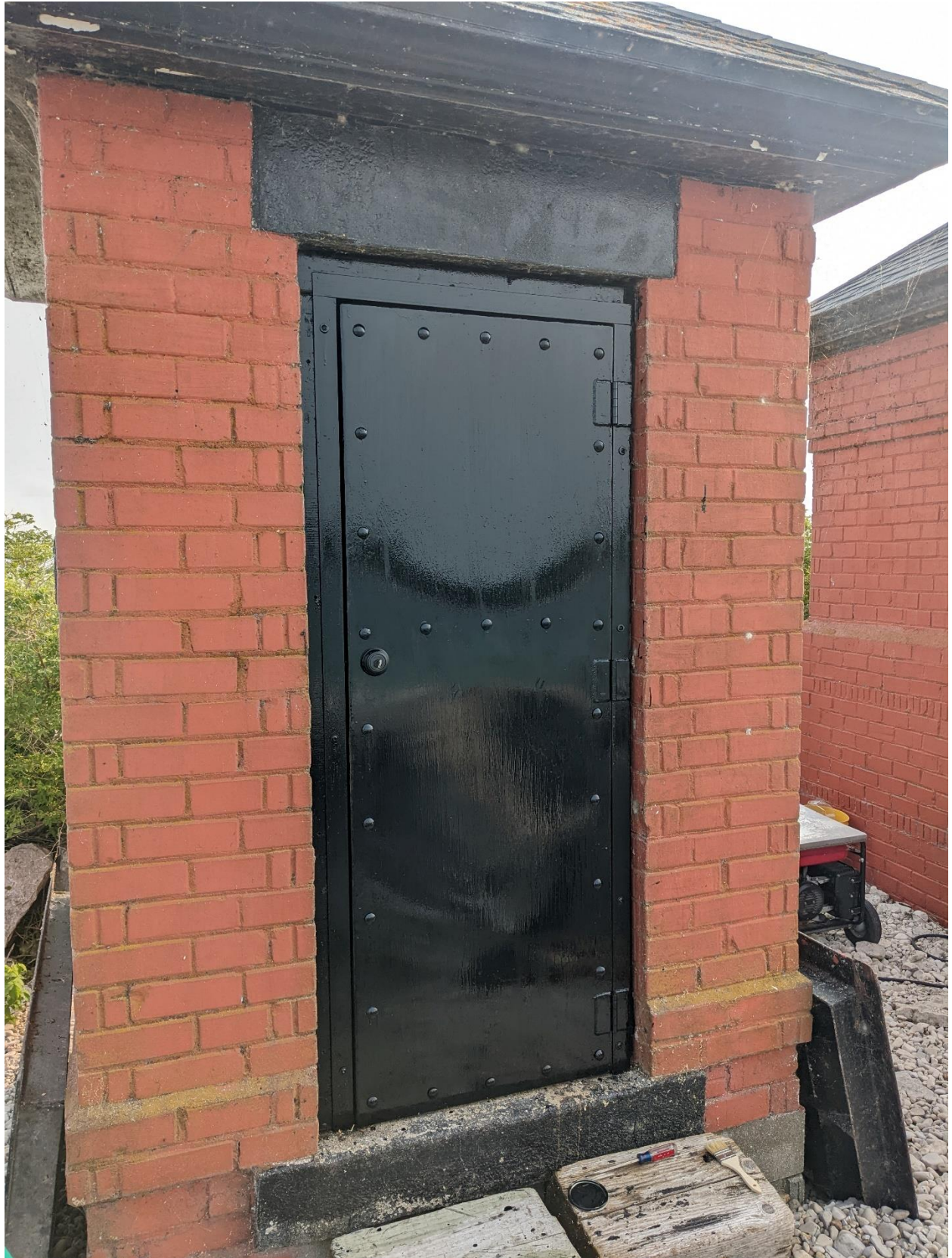
Figure 6 Newly installed and painted privy door