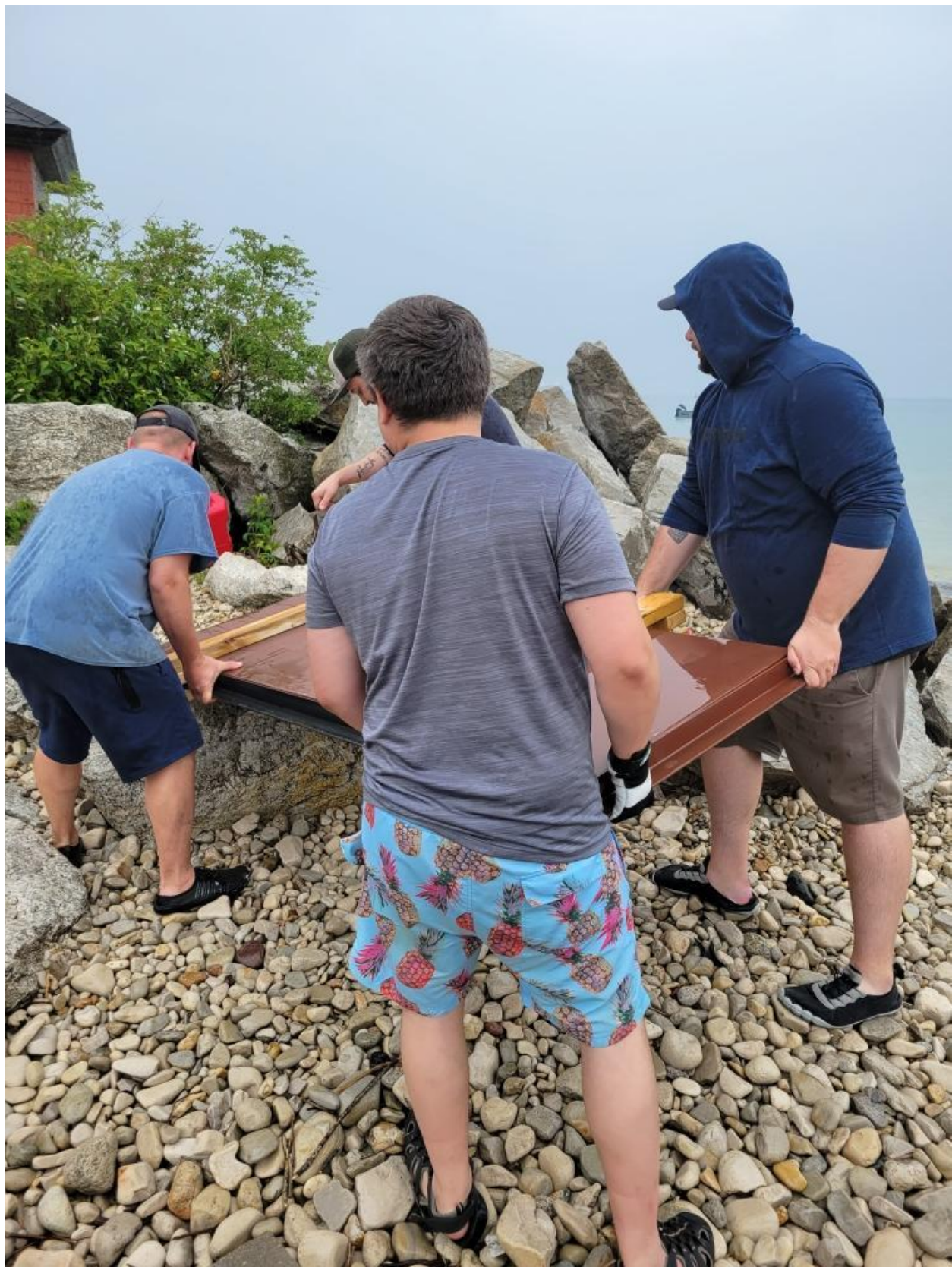
Figure 4 Society Members bring privy door ashore for installation