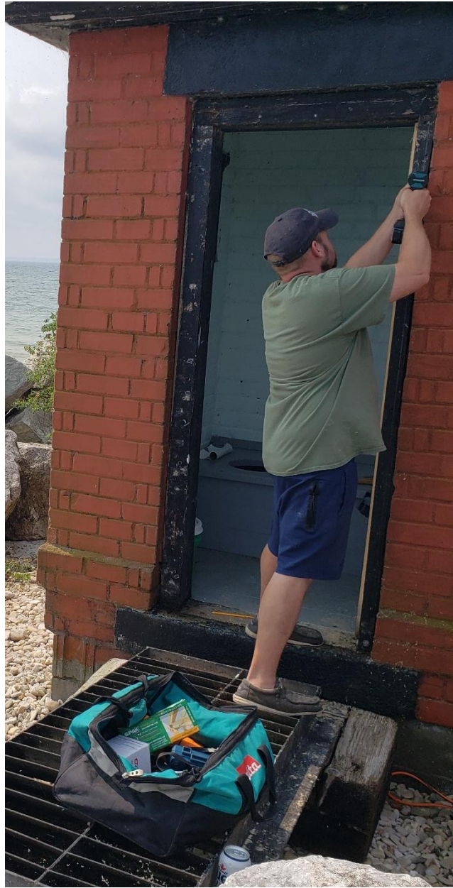
Figure 7 Preparations made for installation of privy door