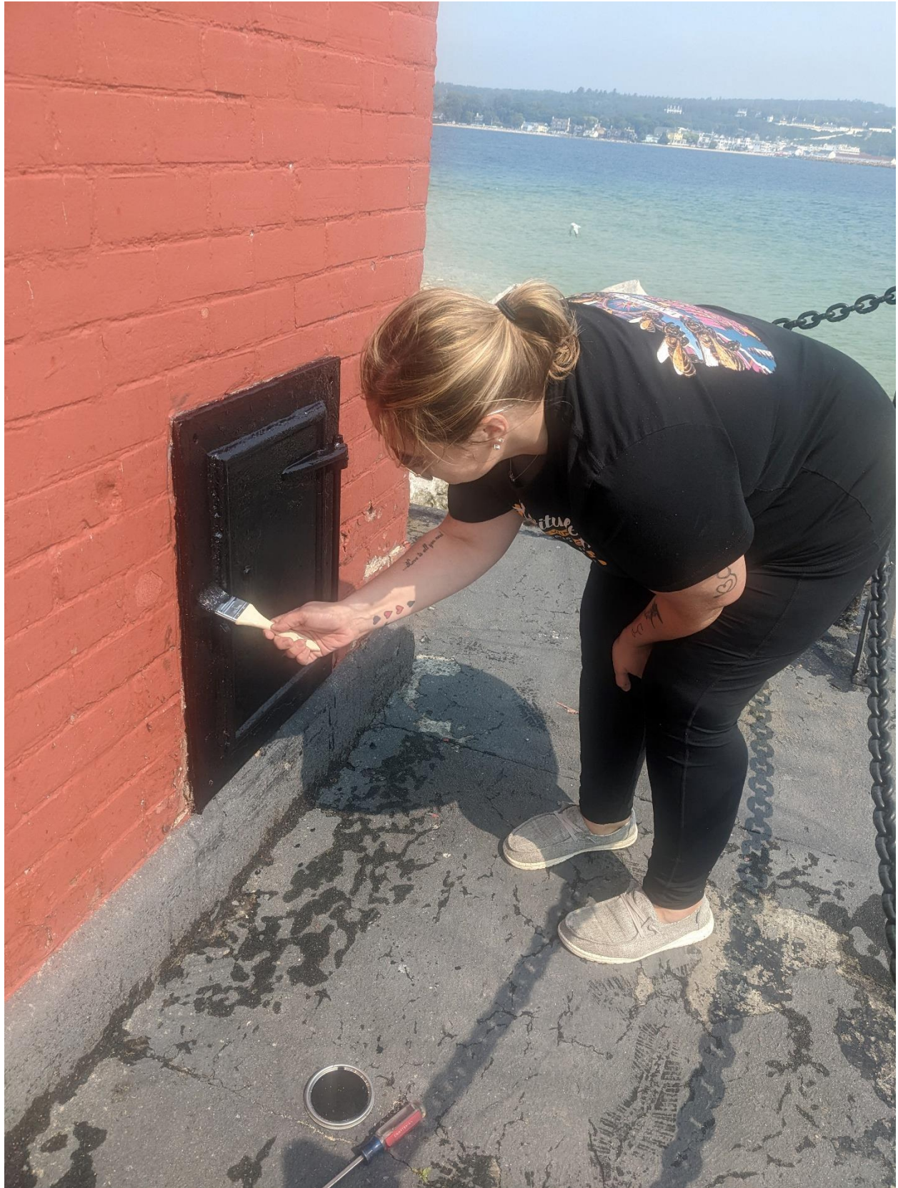
Figure 8 Touch up painting was performed to chain railing and coal doors