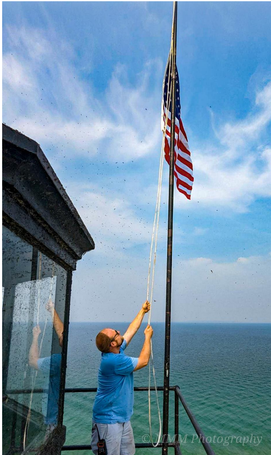
Figure 3 Soccity President raises flag for season