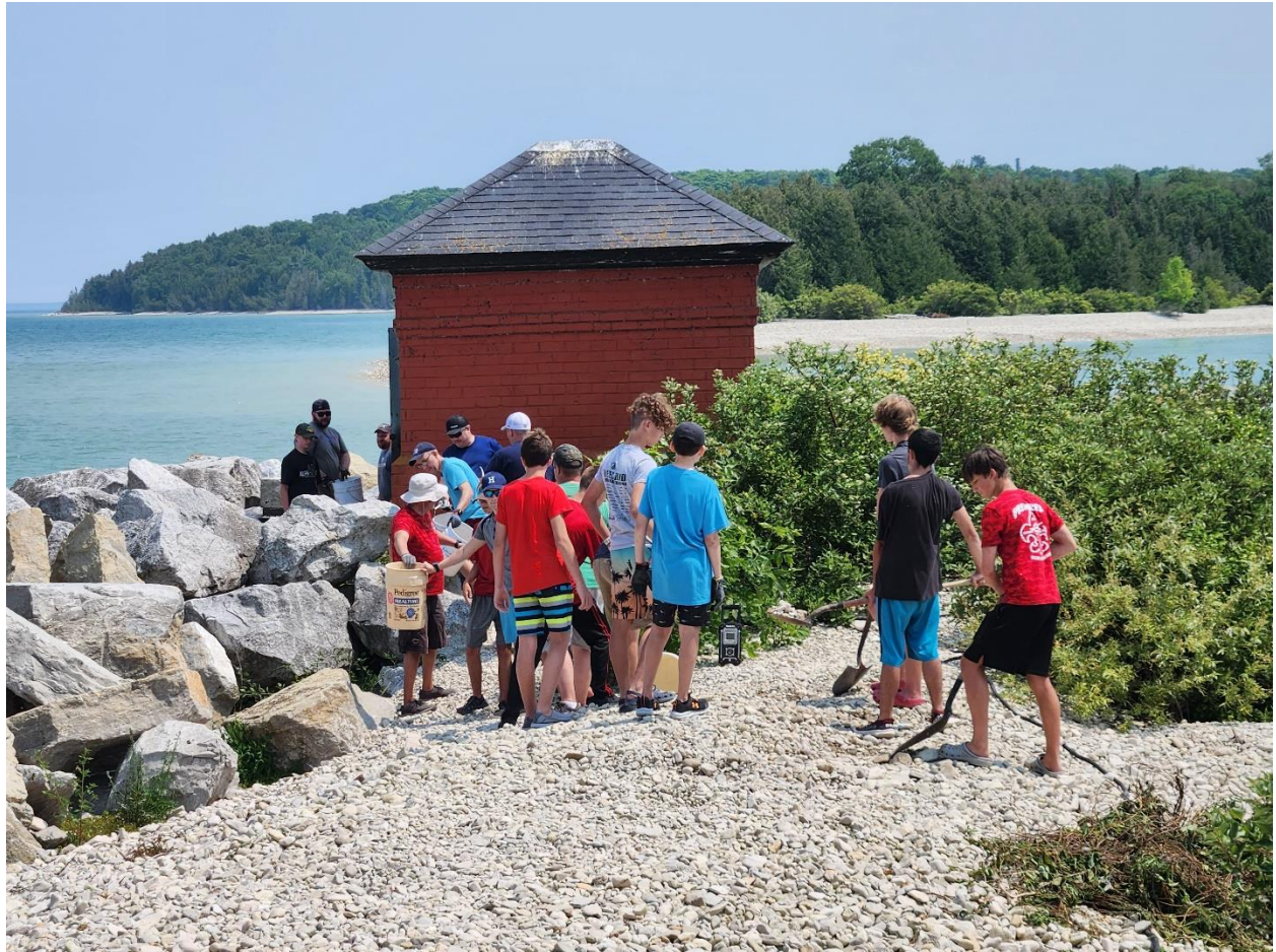
Figure 12 Continued Shoreline Restoration