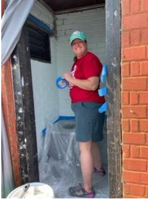
Figure 2: Volunteer Prepares to finish painting interior of privy