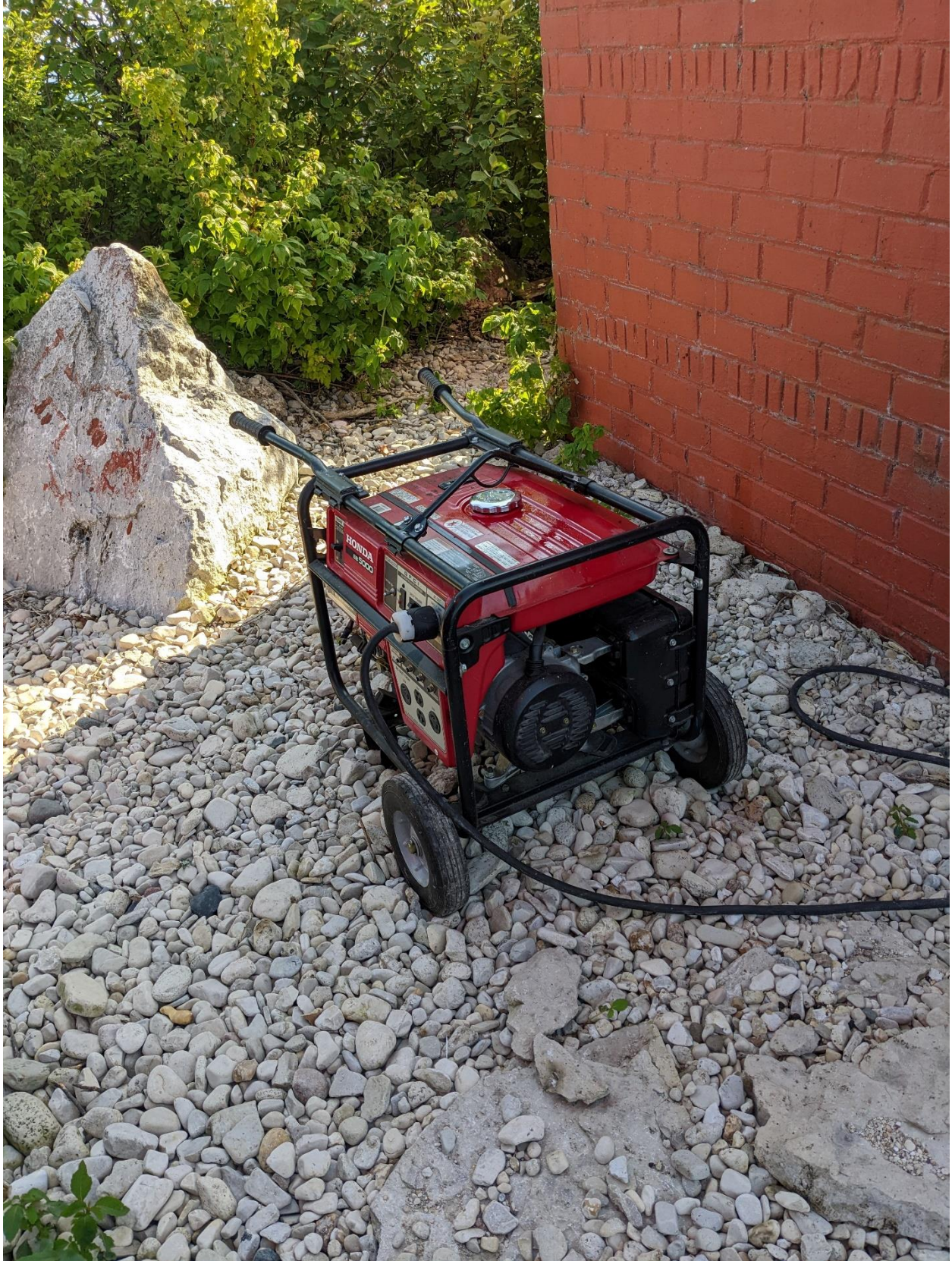
Figure 9 Maintenance was performed to Society's Generator