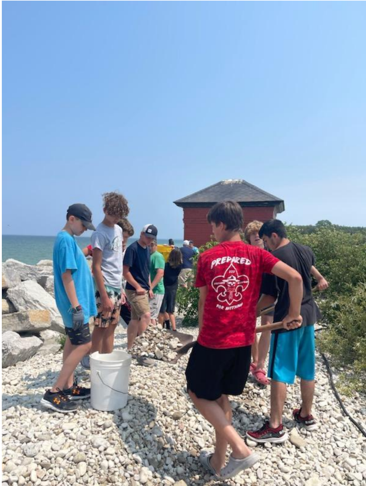
Figure 1 Scouts of Troop 323 work to move gravel to repair damaged shoreline from 2020 high water