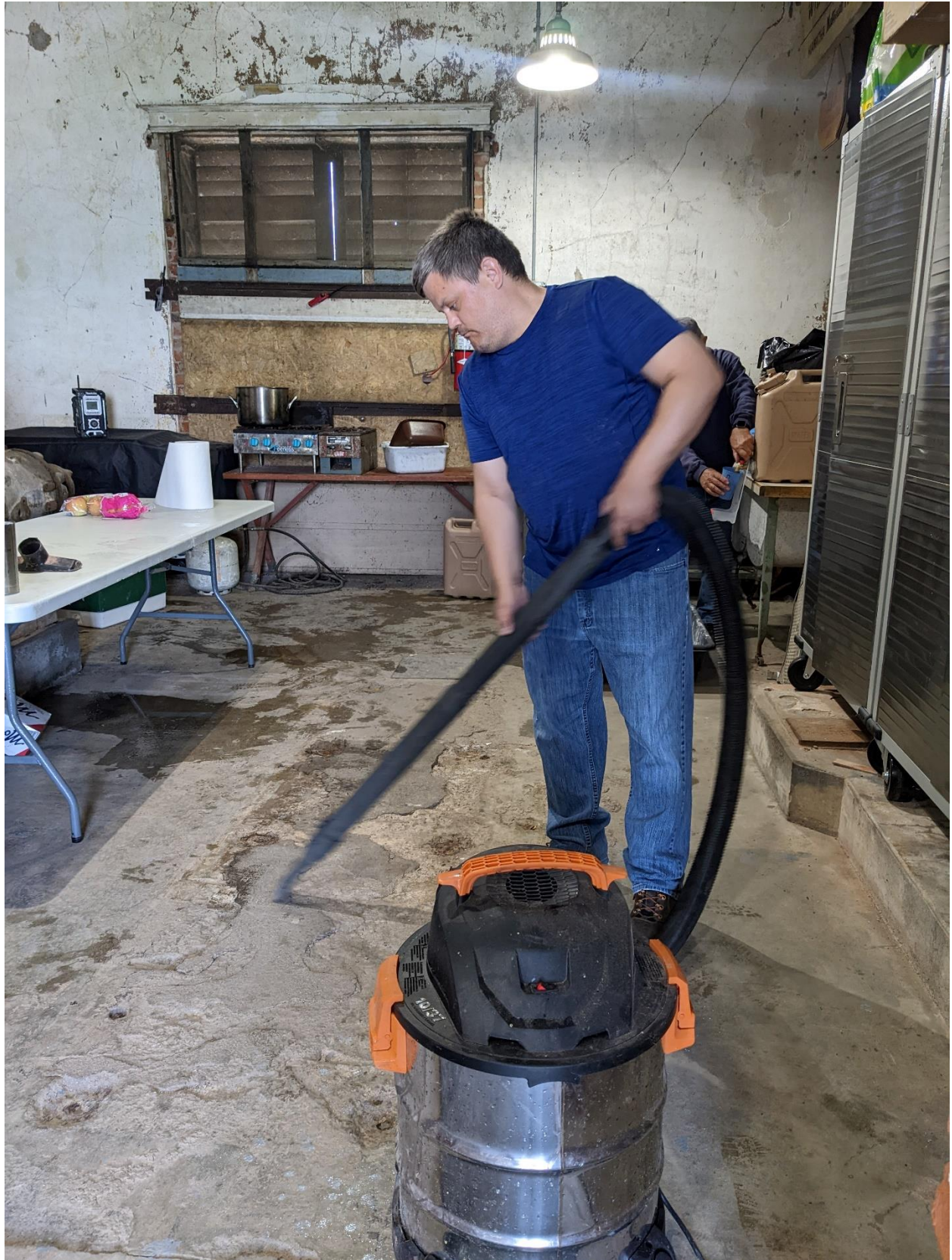
Figure 10 Thorough cleaning was performed throughout the lighthouse