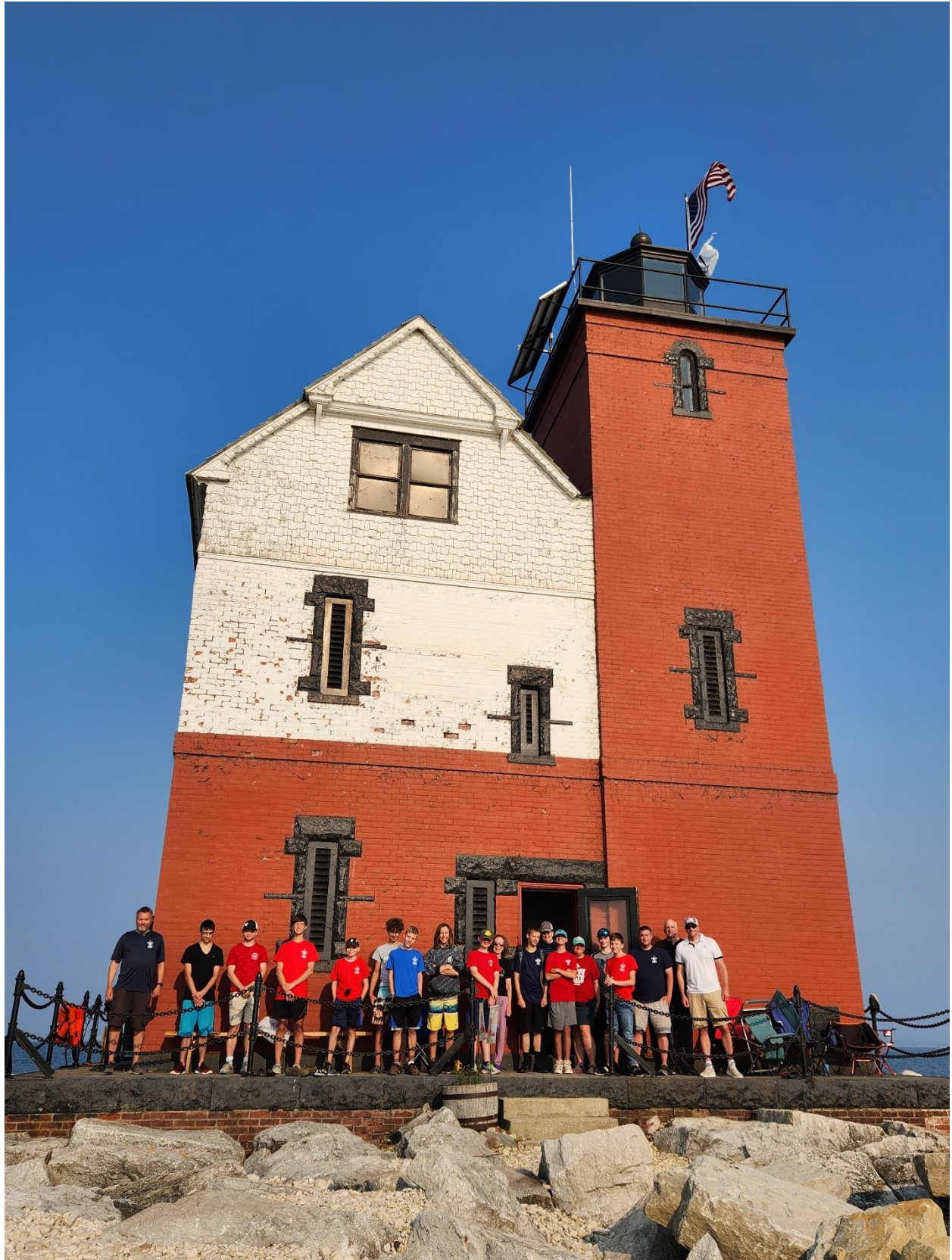
Figure 11 Boy Scout volunteers of troop 323 assisted RILPS in June